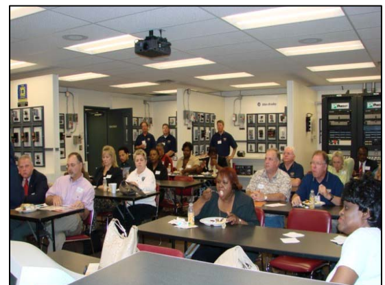
Guidance counselors at the educational breakfast sponsored by Mid-South IEC.