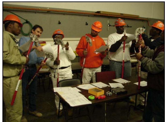
Greater St. Louis apprentice students learning pipe-bending.